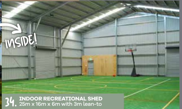
34. INDOOR RECREATIONAL SHED 25m x 16m x 6m with 3m lean-to