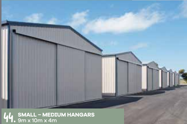
44. SMALL - MEDIUM HANGARS 9m x 10m x 4m