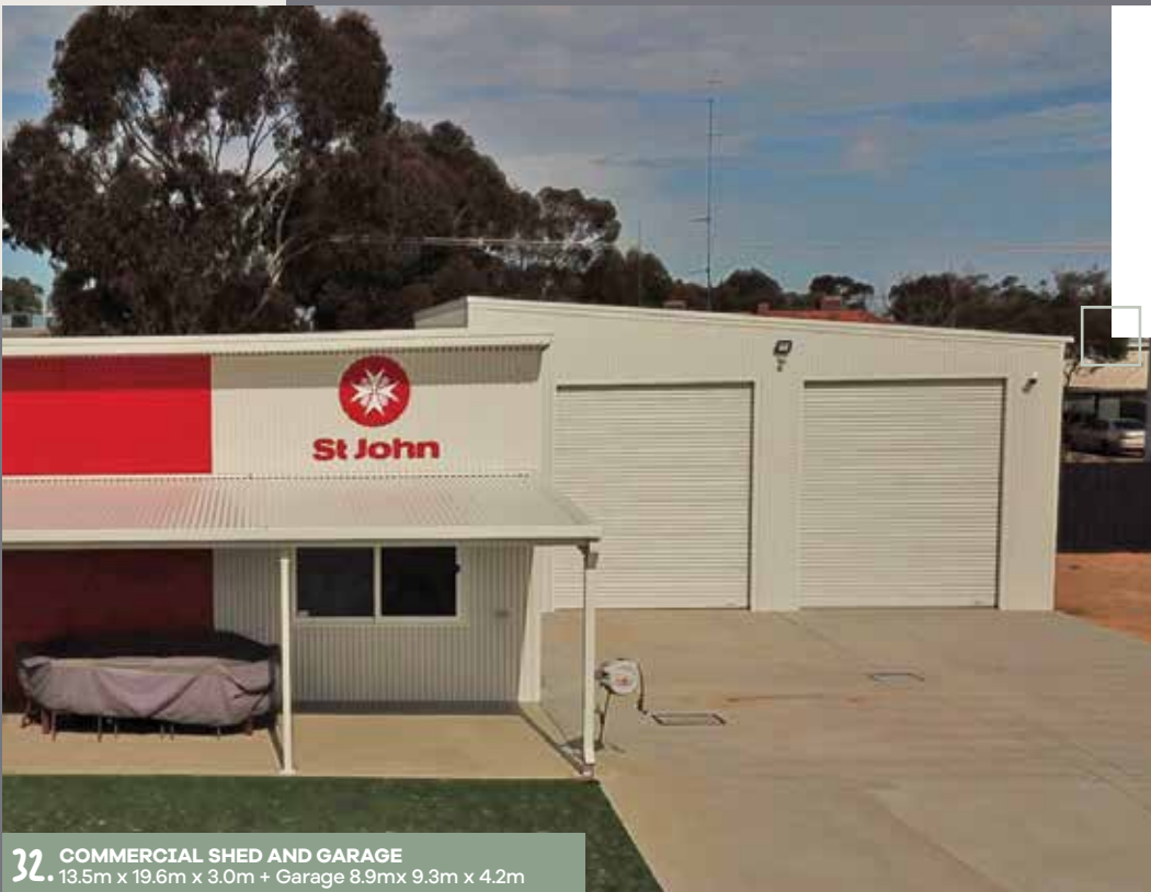
32. COMMERCIAL SHED AND GARAGE 13.5m x 19.6m x 3.0m + Garage 8.9m x 9.3m x 4.2m

You need a space that will work for your business. From large mixed-use buildings to partitioned offices or storage areas, your commercial shed or garage can be designed to suit your business perfectly.