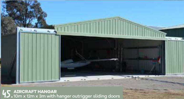
45. AIRCRAFT HANGAR 10m x 12m x 3m with hanger outrigger sliding doors

*Sizes are indicative only. All measurements should be checked prior to purchase.