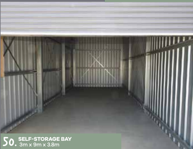
50. SELF-STORAGE BAY 3m x 9m x 3.8m