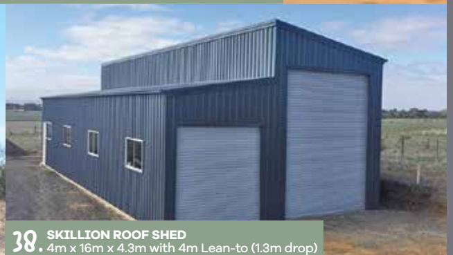
38. SKILLION ROOF SHED 4m x 16m x 4.3m with 4m Lean-to (1.3m drop)

*Sizes are indicative only. All measurements should be checked prior to purchase.