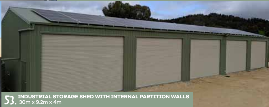
53. INDUSTRIAL STORAGE SHED WITH INTERNAL PARTITION WALLS 30m x 9.2m x 4m