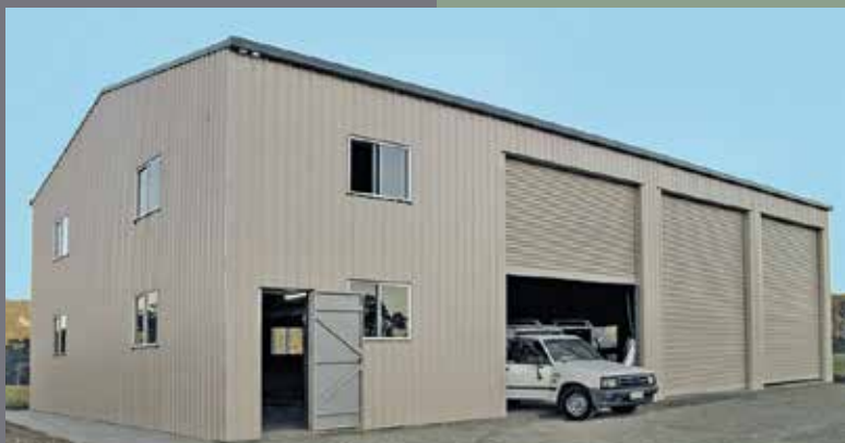
40. INDUSTRIAL UNIT WITH MEZZANINE FLOOR 10m x 20m x 5m