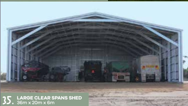
35. LARGE CLEAR SPANS SHED 36m x 20m x 6m