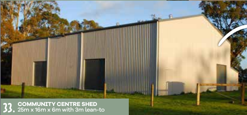
33. COMMUNITY CENTRE SHED 25m x 16m x 6m with 3m lean-to