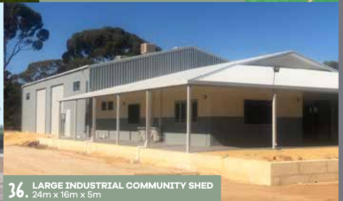
36. LARGE INDUSTRIAL COMMUNITY SHED 24m x 16m x 5m