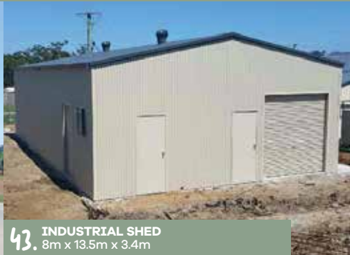
43. INDUSTRIAL SHED 8m x 13.5m x 3.4m