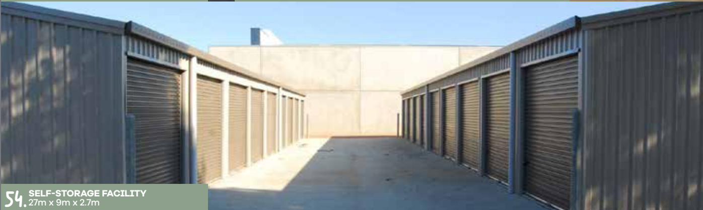
54. SELF-STORAGE FACILITY 27m x 9m x 2.7m

*Sizes are indicative only. All measurements should be checked prior to purchase.