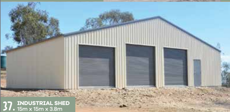
37. INDUSTRIAL SHED 15m x 15m x 3.8m