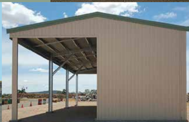
41. OPEN SIDE & FRONT SHED 9m x 18m x 4.7m