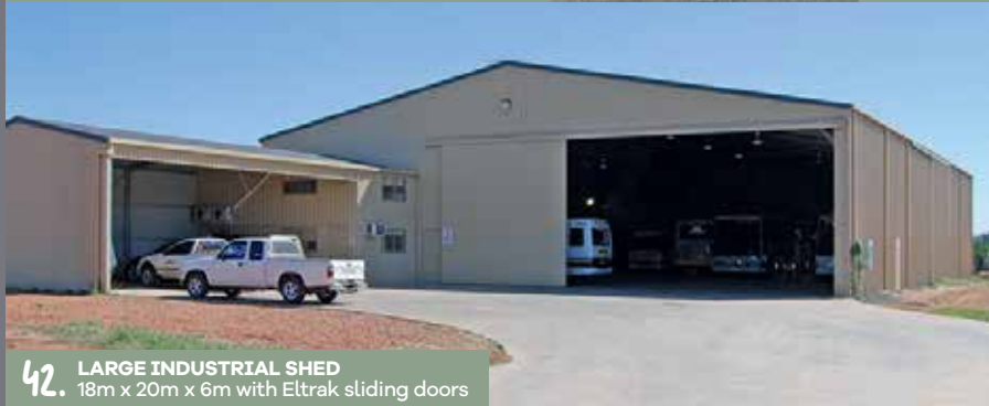
42. LARGE INDUSTRIAL SHED 18m x 20m x 6m with Eltrak sliding doors