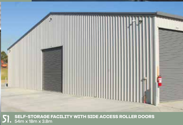
51. SELF-STORAGE FACILITY WITH SIDE ACCESS ROLLER DOORS 54m x 18m x 3.8m