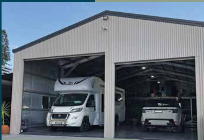
10. MULTI-PURPOSE RESIDENTIAL GARAGE 20m x 9.5m x 4m with mezzanine floor