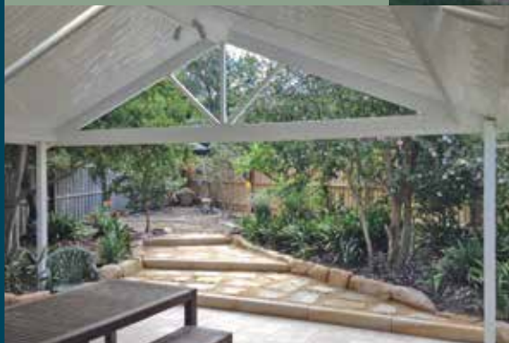
27. GABLE PATIO AWNING SUNSET ROOF 22 degrees with 3 spoke open decorative infill