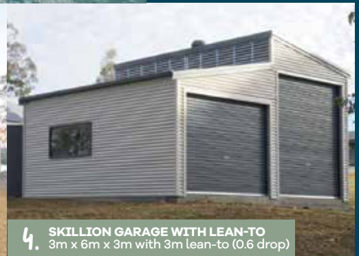
4. SKILLION GARAGE WITH LEAN-TO 3m x 6m x 3m with 3m lean-to (0.6 drop)