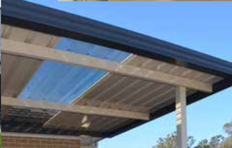
30. FLAT ROOF PATIO Mono-clad with polycarbonate light panel