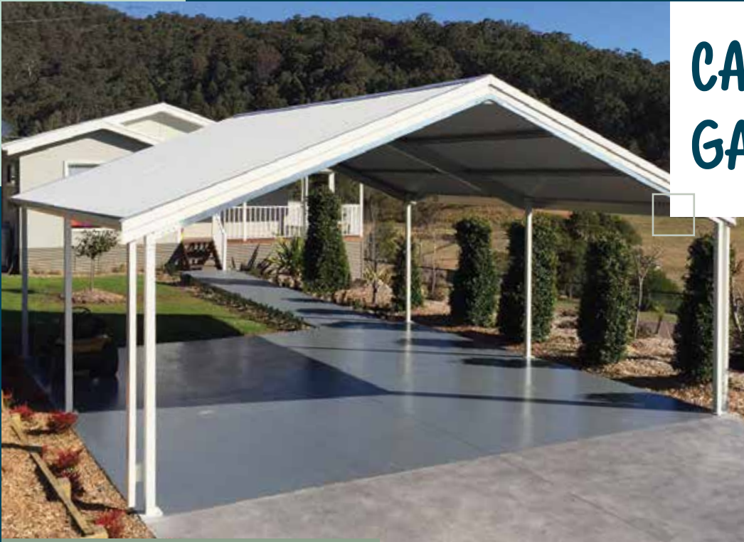
16. LARGE OPEN GABLE CARPORT 7m x 8m x 2.5m

With a range of designs and roof profiles, our carports and garaports can be customised to complement surrounding buildings, in a colour combination and size to suit your needs.