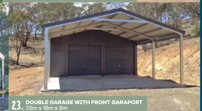
23. DOUBLE GARAGE WITH FRONT GARAPORT 7.5m x 18m x 3m

*Sizes are indicative only. All measurements should be checked prior to purchase.