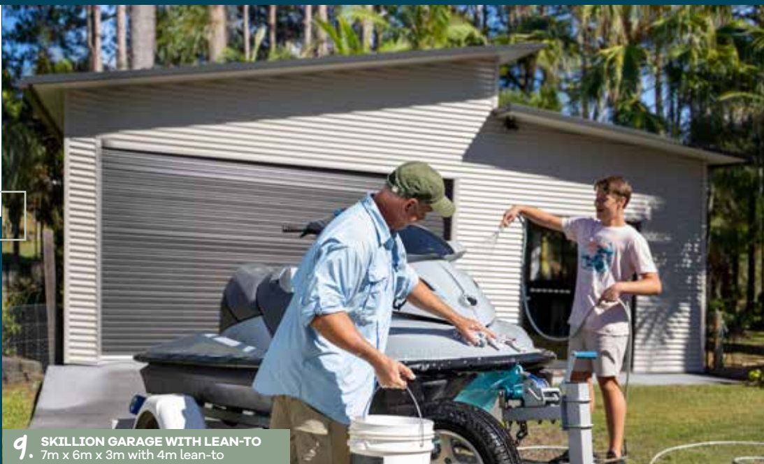
9. SKILLION GARAGE WITH LEAN-TO 7m x 6m x 3m with 4m lean-to

Whether it's a single garage, a multi car garage, or even a workshop, we can help you come up with a design that is right for you.