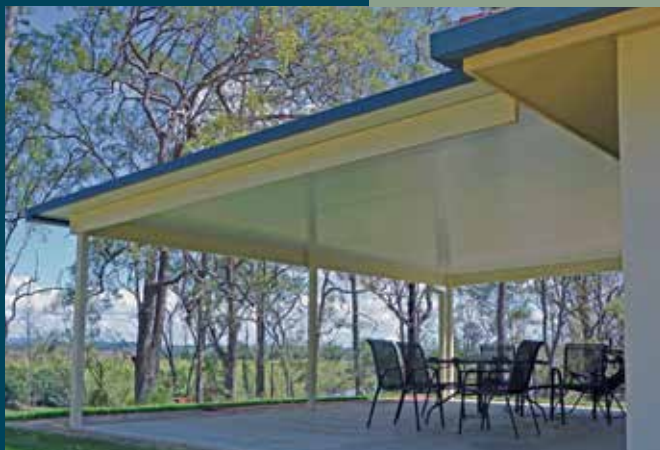
25. INSULATED FLAT ROOF PATIO AWNING