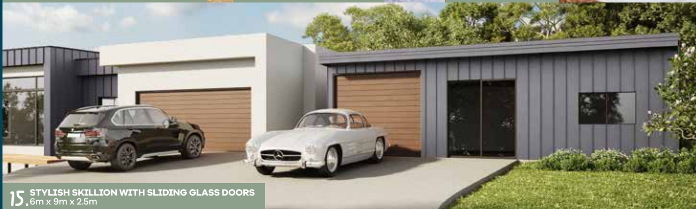
15. STYLISH SKILLION WITH SLIDING GLASS DOORS 6m x 9m x 2.5m

*Sizes are indicative only. All measurements should be checked prior to purchase.