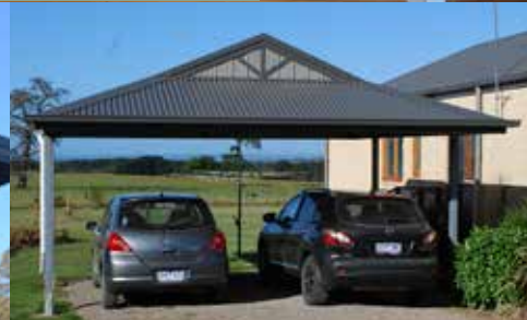
31. DUTCH GABLE CARPORT

*Sizes are indicative only. All measurements should be checked prior to purchase.