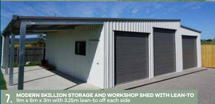
7. MODERN SKILLION STORAGE AND WORKSHOP SHED WITH LEAN-TO 9m x 6m x 3m with 3.25m lean-to off each side