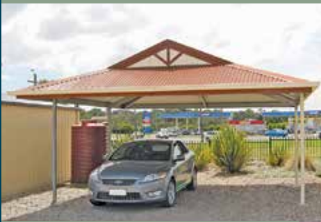
17. DOUBLE DUTCH GABLE ROOF CARPORT 6m x 6m x 2.7m