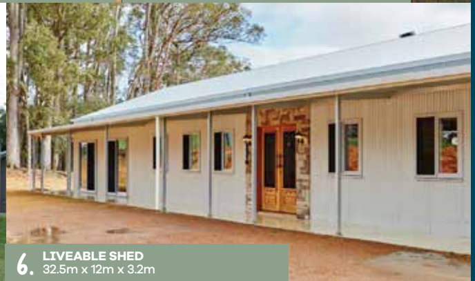
6. LIVEABLE SHED 32.5m x 12m x 3.2m