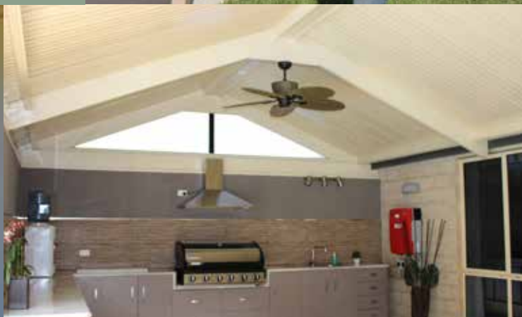
26. GABLE PATIO AWNING SUNSET ROOF - 22 DEGREE ROOF PITCH