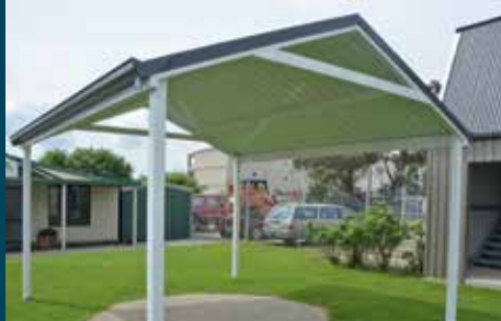
29. OPEN GABLE CARPORT MONOCLAD ROOF Great for boats & higher vehicles