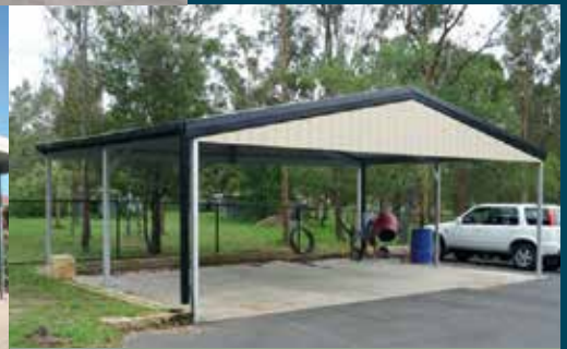
19. TRIPLE GABLE ROOF CARPORT + GABLE INFILL 9m x 5.5m x 2.7m