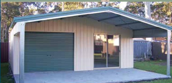
20. DOUBLE GARAGE WITH FRONT GARAPORT 8m x 6m x 2.4m enclosed shed with 3m Garaport