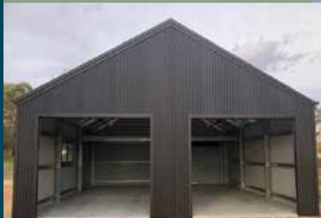
12. DOUBLE GARAGE WITH GABLE ROOF 7m x 9m x 3m