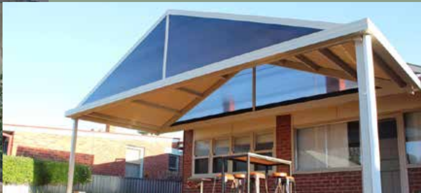
28. GABLE PATIO AWNING CORRUGATED ROOF 22 degrees with closed ends using twinwall polycarbonate