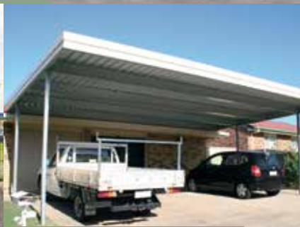
18. TRIPLE FLAT ROOF CARPORT 9m x 5.5m x 3.1m