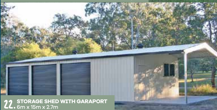
22. STORAGE SHED WITH GARAPORT 6m x 15m x 2.7m