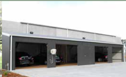
14. 4 BAY GARAGE 18m x 8m x 2.7m