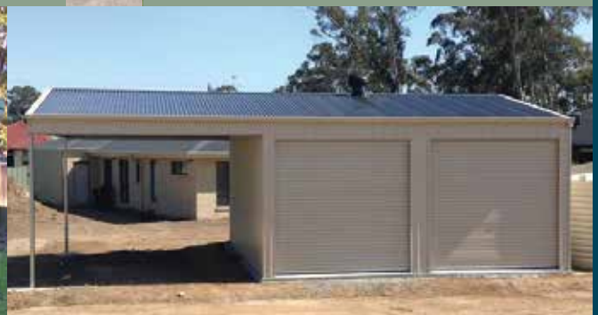
21. DOUBLE GARAGE WITH END GARAPORT 6.5m x 6m x 2.9m