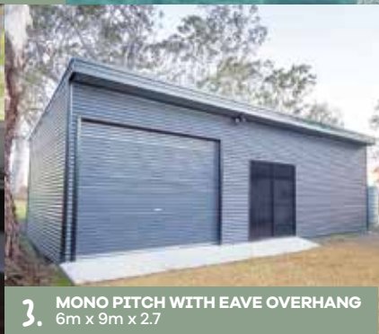
3. MONO PITCH WITH EAVE OVERHANG 6m x 9m x 2.7