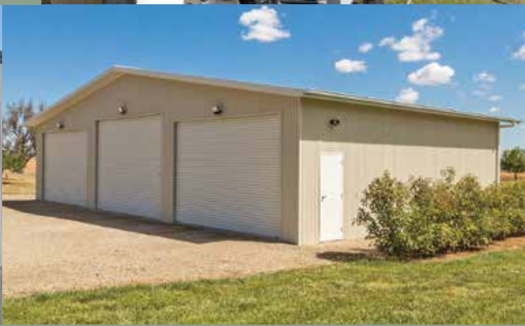
11. TRIPLE DOOR GARAGE WITH EAVES ALL AROUND 10m x 10m x 3m