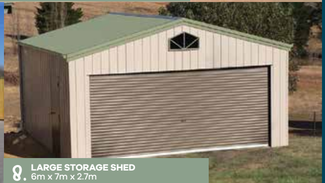
8. LARGE STORAGE SHED 6m x 7m x 2.7m

*Sizes are indicative only. All measurements should be checked prior to purchase.