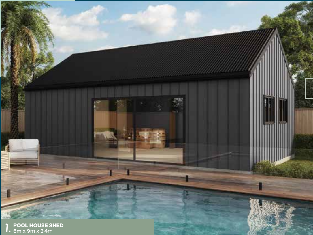
1. POOL HOUSE SHED 6m x 9m x 2.4m

The great Aussie shed can be as unique as our DNA. From extra storage, to a garage, workshop, home office or recreational space, a shed can provide many lifestyle benefits.