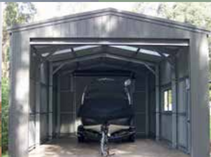
13. STANDALONE GARAGE 5m x 9m x 3.5m