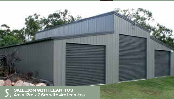
5. SKILLION WITH LEAN-TOS 4m x 12m x 3.6m with 4m lean-tos